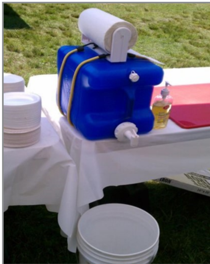
Simple handwashing station containing soap, potable water, single-use paper towels, and receptacles for collecting used water and paper towels. Instructions are available at https://doitandhow.com/?s=water+station