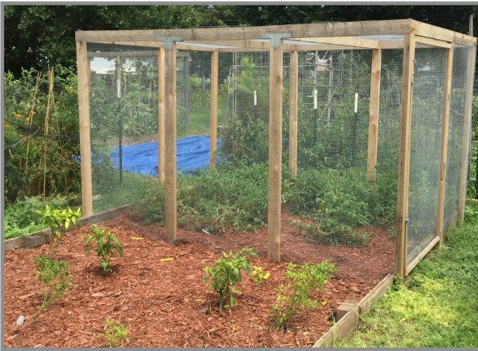
Fences and enclosures like this one keep deer and other wildlife out of the garden.