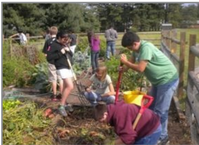
Students using tools in the garden.