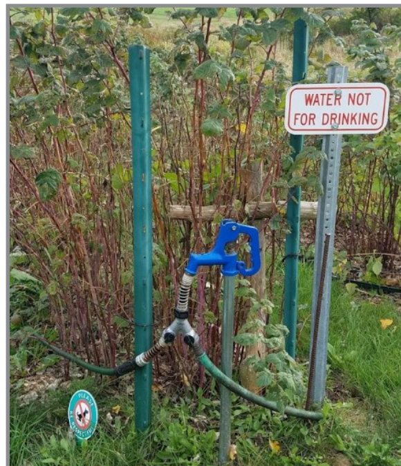
The best way to learn about your school's water quality is to test it.

Diseases, poor soil conditions, unusual weather, and many other living and nonliving factors cause other plant problems. These and other garden setbacks can serve as positive learning experiences by exploring the possible causes and the web of ecological relationships behind garden phenomena. We recommend that you practice Integrated Pest Management (IPM), a holistic approach to garden problem solving. To learn how to identify and manage insect pests, beneficial insects, plant diseases and weeds, visit the University of Maryland Extension's Home & Garden Information Center website https://extension.umd.edu/hgic