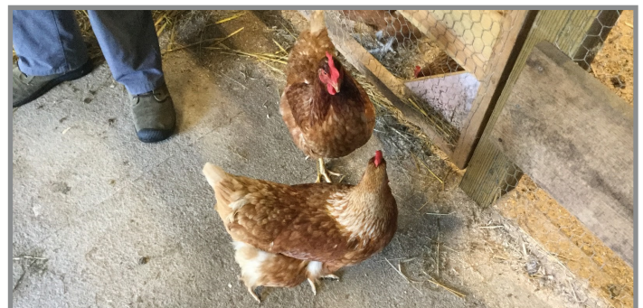
Chickens are natural carriers of germs such as Salmonella and Campylobacter.

Chicken litter, which includes feces, spilled feed, feathers, and bedding material, can harbor harmful germs. To avoid spreading germs to your garden, do not locate chicken coops close to gardens. Since litter can collect on the soles of shoes, avoid going from chicken coops to gardens. Do not allow chickens to enter the garden or the classrooms. Children should wash their hands before and after any interactions with chickens. This will both protect the chickens from illnesses and prevent the spread of germs from the chickens themselves.