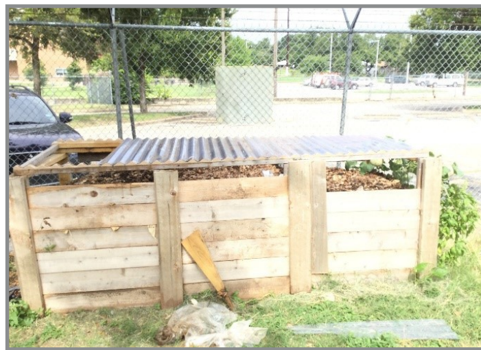
Compost piles in the garden going through the cooking stages.

Instruct students using tools to stay an arm's length plus the tool length away from the next person. Students should not hold tools above waist level. Instruct them not to run or play around while holding tools. Lean all long-handle tools against a wall or fence when not in use. Never lay a metal rake on the ground. Monitor the garden for tripping hazards, especially tools and hoses. Post tool safety reminders where students will see them often such as tool shed doors.