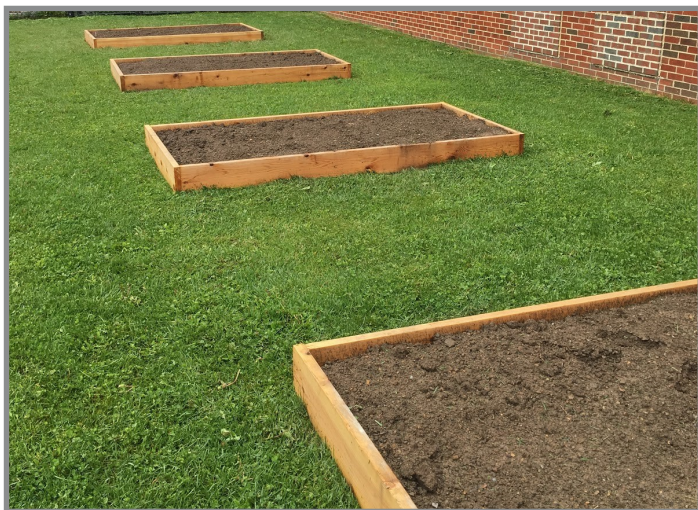
Working with raised beds can help protect students from elevated soil lead levels.