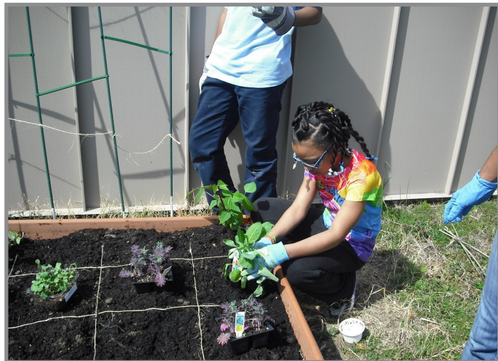
Wearing gloves can help prevent cross-contamination of microorganisms and protect hands while gardening.

Closely monitor students using sharp tools such as spades, trowels, clippers, and scissors. Identify and explain which tools are for adult use only. Tool use by adults and students will vary from school to school.