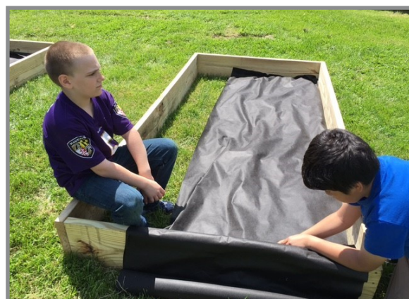
Students line a raised bed with fabric to prevent weeds from growing.