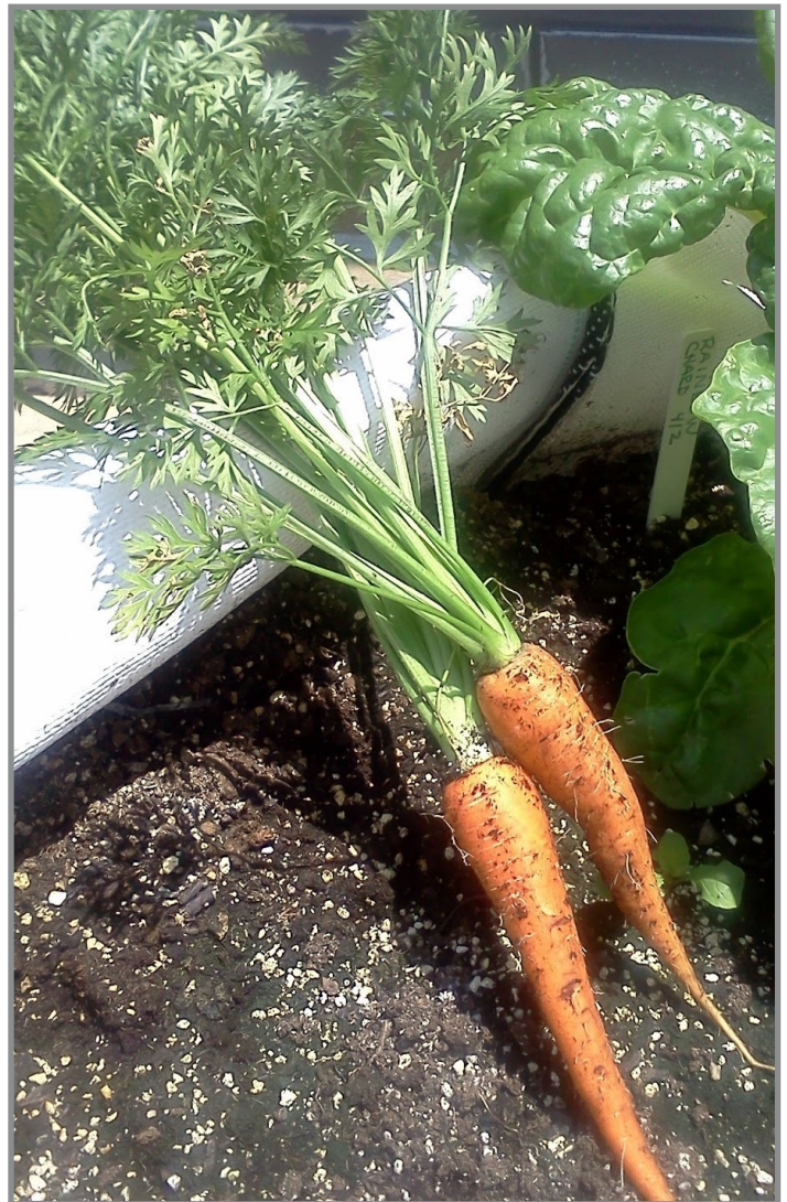
Cleaning root vegetables like these carrots is a good way to remove soil and reduce risk.