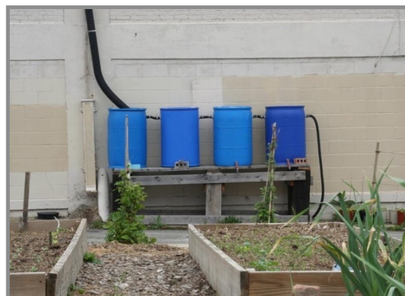
Rain barrels in the garden. Water from rain barrels are best used for non-edible crops, such as flowers that will not be eaten.