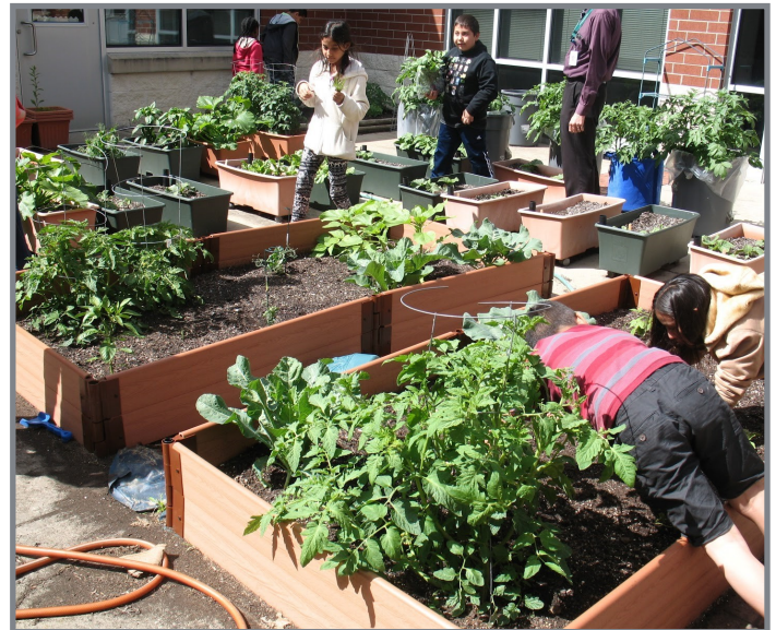
Students harvest from raised beds. Make sure beds are built on level ground with easy access and available water.

Follow the steps below to ensure that your school garden or greenhouse is managed in a way that provides a safe working and learning environment, as well as safe produce for consumption.