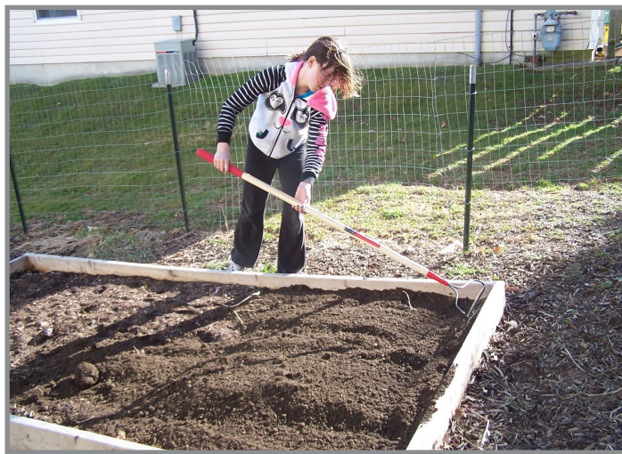
A student spreads a soilless potting mix in a raised bed.