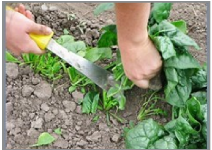
Harvesting tools should be cleaned before and after use. If time allows, consider sanitizing harvesting tools.

Without the use of a sanitizer in the water, it is possible for contamination on one piece of produce to spread to all of the produce in the tank water. Check with the school to determine if teachers can wash produce or if cafeteria personnel should assist. Cleaning and peeling root vegetables such as carrots is a good way to remove soil and reduce the risk of pathogens or heavy metals on the produce. You do not have to wash any produce not eaten immediately after harvest. Wash it prior to eating which reduces moisture on the produce and prevents the growth of mold and bacteria.