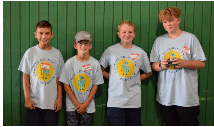
Congratulations to our Intermediate Team, Land Droids, for winning 2nd place in their division!