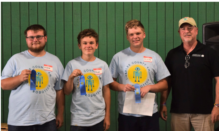
Congratulations to our Senior team, Lumber Bots, for winning 1st place in their division! Awesome Job!