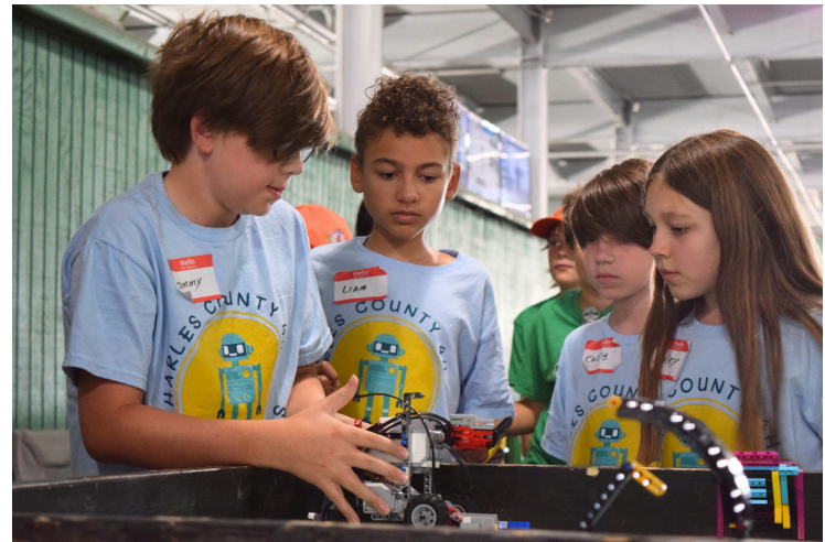
Congratulations to the Rock'n Robots for getting 6th place in the intermediate division!