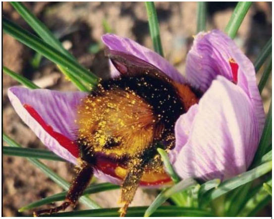
Tired little bee worked so hard he fell asleep on the job!