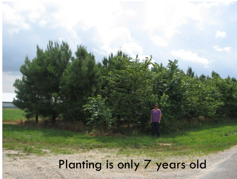
Planting is only 7 years old