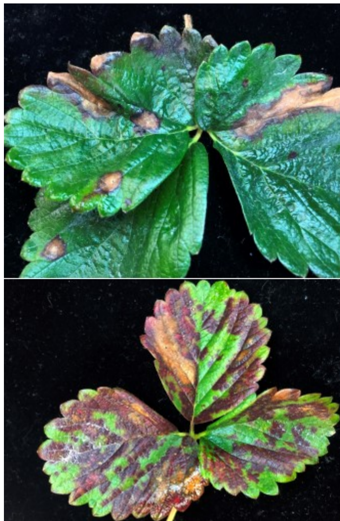
Figure 1 (top). Symptoms of Neopestalotiopsis -infected leaves; Cv: Chandler. Figure 2 (bottom). Advanced infection of powdery mildew. The necrotic reaction to powdery mildew can happen in some cultivars, and could be confused with Neopestalotiopsis or other foliar issues; Cv: Chandler.

Recently, severe outbreaks of Neopestalotiopsis related disease were reported in FL strawberry fields, where root, crown, petiole, fruit, and leaf symptoms were observed ( https://gcrec.ifas.ufl.edu/media/gcrecifasufledu/docs/pdf/berry-newsletter/2019---March.pdf ). Two species including N. rosae and the novel Neopestalotiopsis sp. noted above were identified as the causal agents. Compared to N. rosae , the new Neopestalotiopsis sp. showed greater pathogenicity in fruit and leaf in vivo . The disease is now considered a major threat by many FL growers. During fall 2020, the same or a similar disease was observed in at least four production fields in NJ, one in PA, and one in MD, which was presumably distributed on strawberry runner tips to one or more plug plant producers. These incidences were reported approximately 3 to 4 weeks after planting. Isolates from one plug producer have been confirmed to be genetically closely related to the isolates that were pathogenic in FL. However, the species has yet to be determined, as characterization and