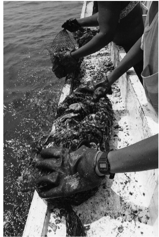
Oyster shell is placed overboard to stabilize bottom grounds and provide a firm substrate for planting oyster seed.

It should be noted that many areas are good for oyster survival and growth but have bottom types that are poor for supporting oysters. Preliminary examination might lead one to believe that such areas are unsuitable for oyster farming. This may not be the case. Bottom stabilization is usually not done annually or even between every crop, although it may be advisable to reevaluate the condition of the bottom prior to reseeding and to add a small amount of cultch material if necessary. In most areas it is the initial placement of cultch that comprises the largest expense in stabilization. This initial application may provide an adequate growing bottom for many years with little or no additional shelling necessary. In such areas the costs associated with this initial stabilization could then be spread out over many successive crops.