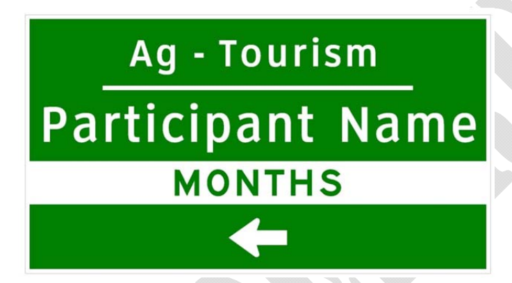
Figure 1 -Ag-Tourism Mainline Sign

MDA and the SHA have approved the Ag-Tourism highway sign design shown in Figure 1 below. The costs for new and replacement signs will be borne by the Ag-Tourism Facilities that meet the program criteria and are approved for signing.