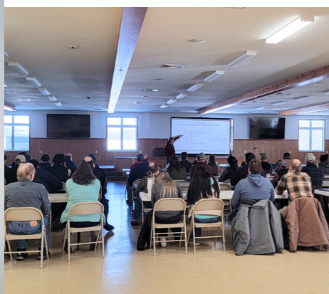
HAY & PASTURE CONFERENCE

Recently, Maryland Department of Agriculture and Freedom AG and Energy recently partnered with University of Maryland Extension to deliver local farmers three workshops which provided an overview regarding pesticide record keeping and storage, productive crops, soil health, nitrogen management, pest management, produce safety to name just a few topics. Farmers were able to obtain Private Applicator Pesticide and Nutrient Applicator Vouchers and Consultant recertification credits for attending.