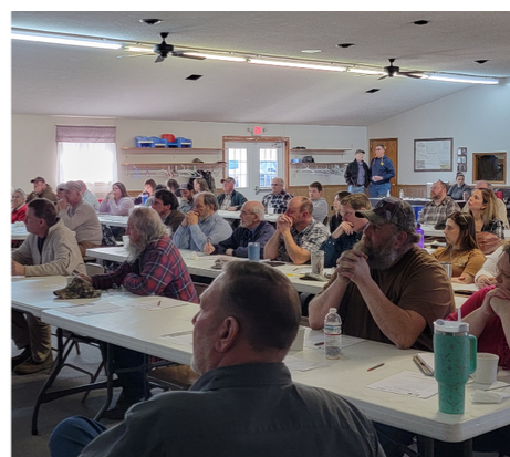
WESTERN MD AGRONOMY MEETING