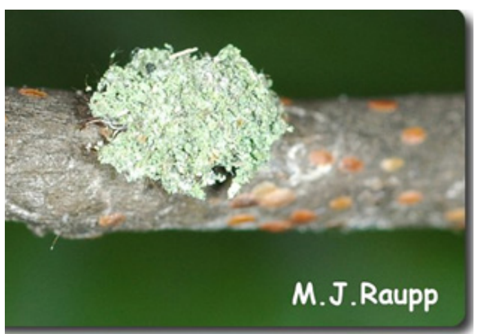
Under this piece of lichen is a predacious lacewing larva. Note the mandibles sticking out the left side of the "lichen".