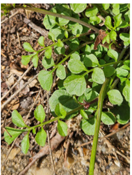
Figure 1. Pinnately lobed leaves.

As our weather continues to get warmer, we will continue to progress through the end of the winter annual life cycle. These weeds have germinated in late summer or early fall, over wintered as seedlings, and began their flowering stage as the weather warmed up this spring. Hairy bittercress, Cardamine hirsuta, is a broadleaf winter annual weed found throughout northeast landscapes and turf. It can be identified in its vegetative stage by its basal rosette of pinnately lobed or compound leaves, each with more than 3 leaflets (Figure 1). The leaflets are rounded, emerging from a petiole that is hairy. Leaf size decreases as they emerge higher on the stem. The flower of this weed will be in clusters at the end of flowering stems, are two to three mm in diameter, and will be made up of four petals (Figure 2). It also has distinct fruiting stems that end with slender seedpods (siliques). These siliques (Figure 3) are narrow capsules that are designed to release the seeds that are held within in an explosive manner, spreading the seed up to ten feet from the plant. In one research study, the average plant produced 68 of these silique or seed pods with an average of 29 seeds per pod.