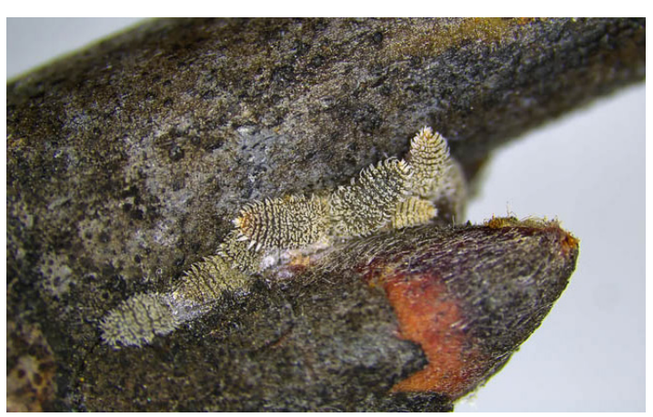
Overwintering European elm scale second instar females. If males are present, they are in white cocoons.

Heather also found overwintering Japanese maple scale on Zelkova serrata 'Green Vase' and overwintering oak lecanium scale on Quercus bicolor in Rockville on March 13. Japanese maple scale has a wide plant host