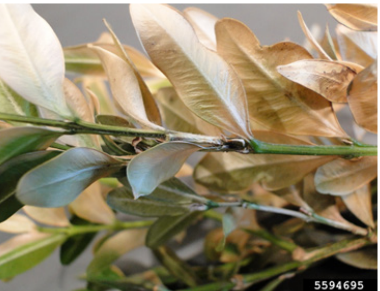
Light tan ("straw color") leaves on boxwoods with Volutella blight.

The symptoms of Volutella blight can be easily confused with those of boxwood blight caused by Calonectria pseudonaviculata , which continues to be a disease of concern in the state. The publication Boxwood: Identify and Manage Common Problems is a great resource for scouting. If you need help diagnosing the problem, reach out to the <u>UMD</u> Plant Diagnostic Lab.