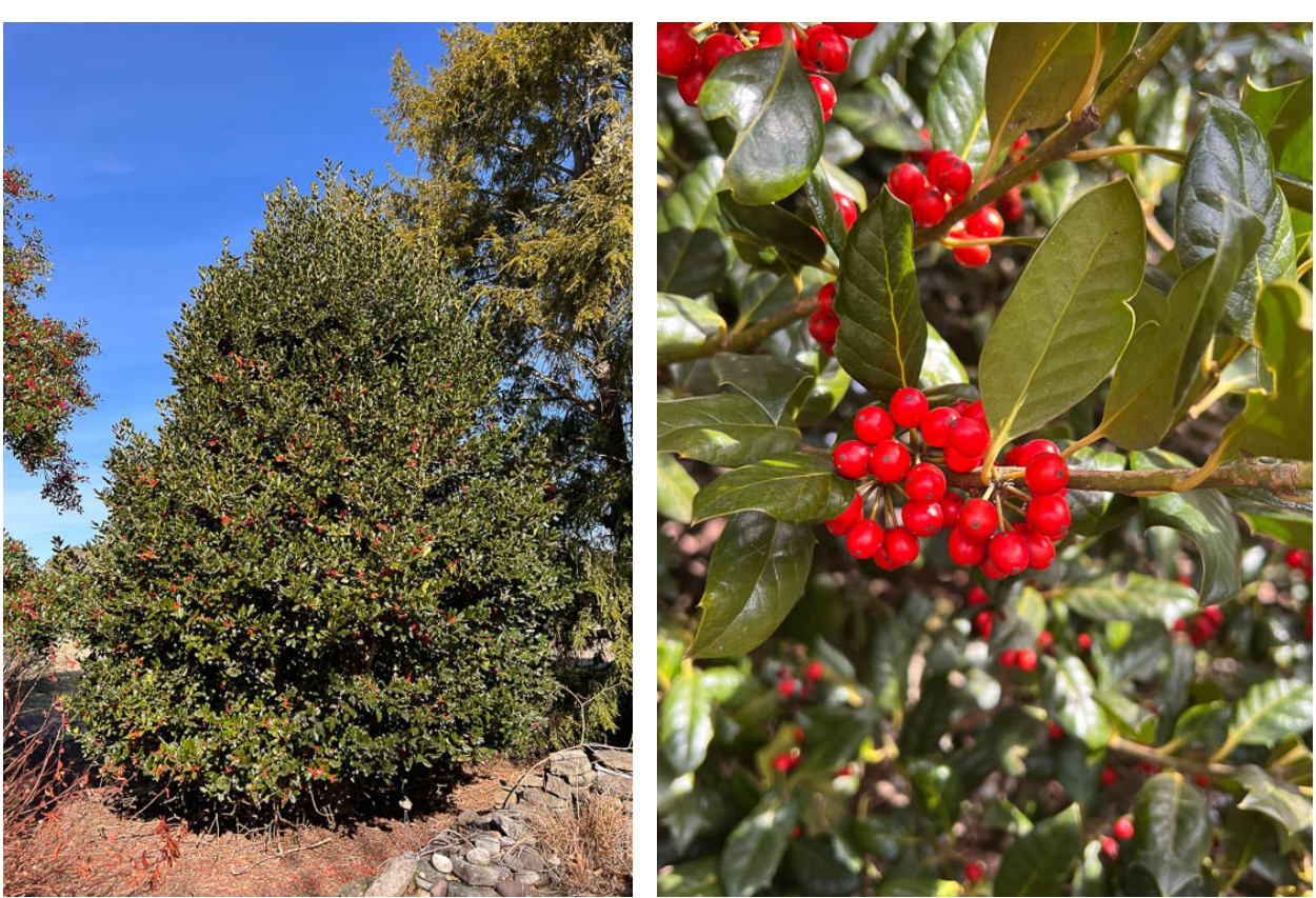
Figure 3. Holly 'Nellie R Stevens' will be blooming soon - then look for bright red berries in the fall.