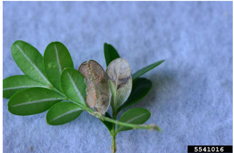
The Volutella pathogens produce fungal fruiting structures observed as salmon-colored "cushions" on the underside of boxwood leaves.