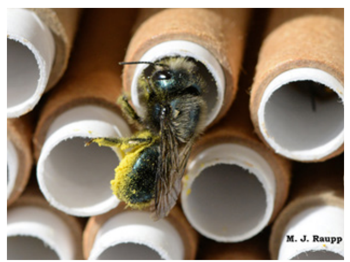
Mason bee female bringing pollen back to her nest-