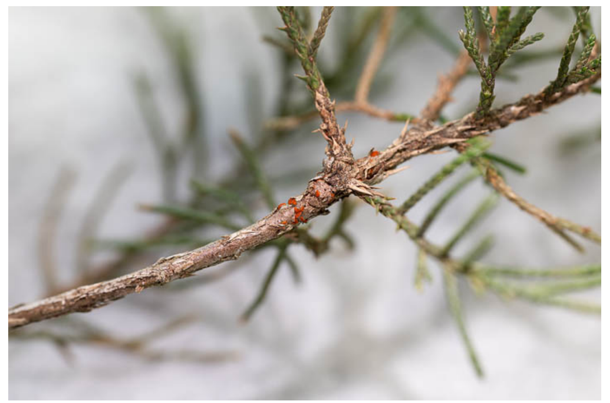
There are several species of Gymnosporangium rusts just ready to release their spores from juniper to their alternate rosaceous hosts. If you're planning on protective fungicide sprays on susceptible hosts, monitor the rain events next week, and time spray applications when the spores become gelatinous.