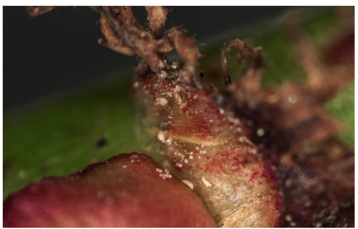
Early symptomatic symptoms on multiflora rose are indicative of rose rosette disease and the eriophyid mite vectors are active now. Monitor rose plantings for early symptoms and promptly remove infected plants to reduce disease spread.