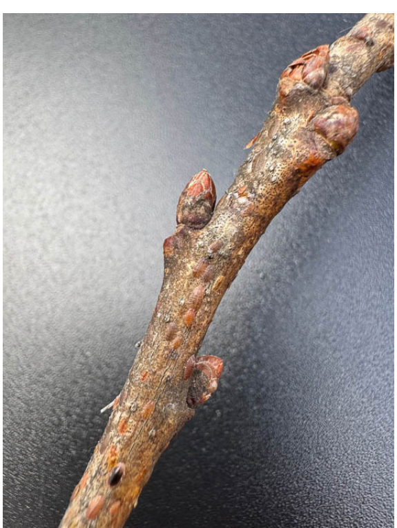
Oak lecanium scale overwinters as immatures on woody stems.

<u>range</u>. Oak lecanium scale is often found on oak species, but it can be found on many other trees and shrubs. Monitor for egg hatch later in the spring (~789 DD). At that time, use pyriproxyfen (Distance) or buprofezin (Talus) to treat the crawlers.