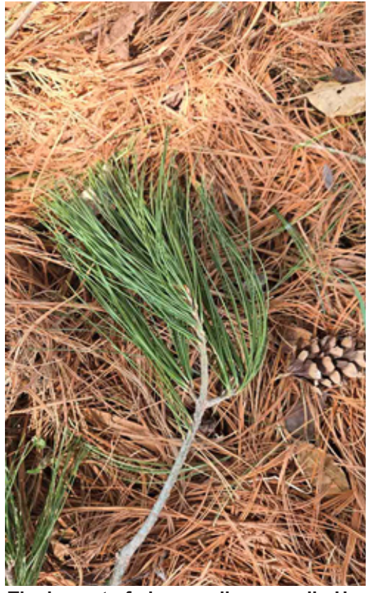
The impact of pine needles on soil pH.

That being said, several studies have shown the needles make good mulch. They are light, they interlock, but do not create a barrier for water infiltration. They depress surface evaporation and allow soil to