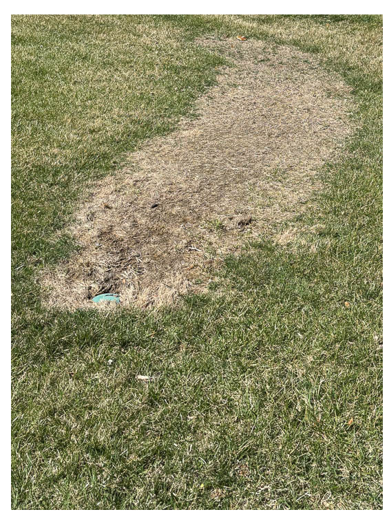
Damage to turf from roofing chemicals.