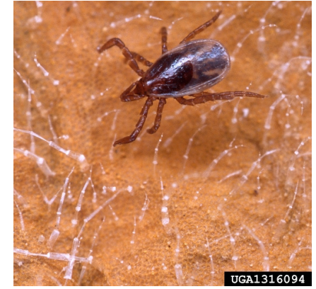
Deer tick nymph