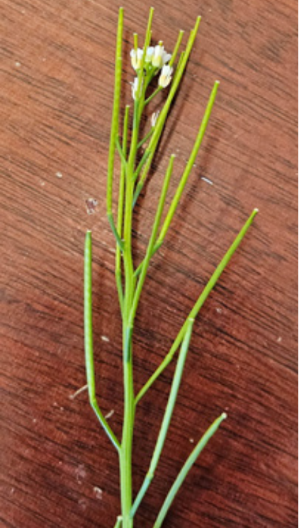
Figure 3. Hairy bittercress seed pods (siliques).

matured. (Once it produces seeds, it's done with its lifecycle, and a herbicide application at this point won't help). A pre-emergent herbicide can be applied in late summer/early fall.