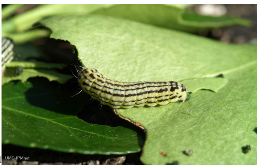
Mid to late instar of the euonymus leaf notcher caterpillar (4/26/06)

One of the earliest insects that causes damage to plants is the euonymus leaf notcher caterpillar (Pryeria sinica). In the U.S., it has been found damaging Euonymus japonicus and E. kiautschovicus 'Manhattan'. This insect overwinters in the egg stage. Eggs start hatching in this area in mid-March to early April. Activity is done by late May. There is only one generation of this pest each year, and plants are usually able to produce enough growth to cover up the damage. If necessary, control options include Bacillus thuringiensis kurstaki (Btk), spinosad, or other products labelled for caterpillars. These caterpillars tend to aggregate on branches so you can prune out parts of the plant with aggregations of caterpillars.