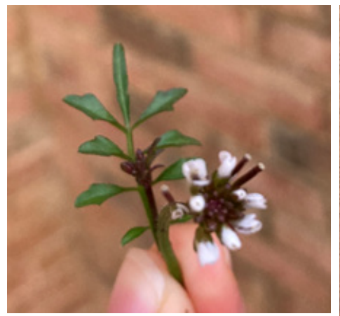
Figure 2. Hairy bittercress flower.

so take control measures to prevent having a healthy crop later this fall. Hairy bittercress is best controlled by maintaining a healthy, dense turf that can compete and prevent weed establishment. It grows best in a cool, moist environment, and often when a turf manager is mowing their lawn too short. Hand pulling is an option if it covers a small area. If the seeds are not yet mature, mowing or weed whacking can be used to prevent seed production. Spring applications of a herbicide (e.g. 2,4-D, MCPP, dicamba, triclopyr) may suppress hairy bittercress if it has not fully