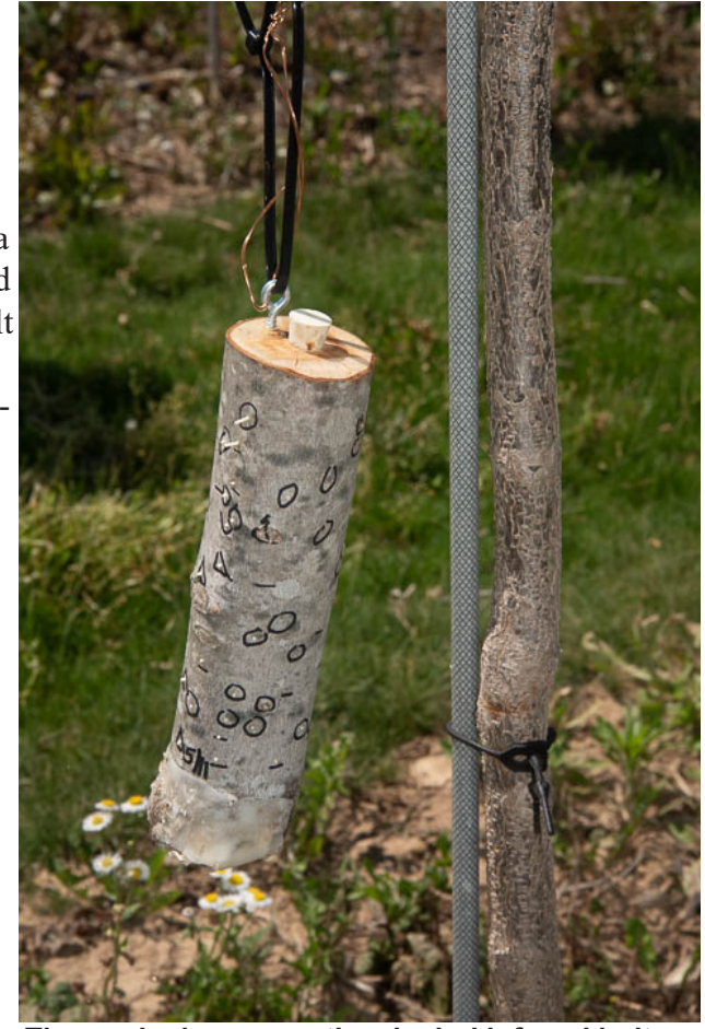
The marked areas on the alcohol infused bolt show where frass is being pushed out by the beetles.

Control: When ambrosia beetles are active, Astro, Permethrin Pro (permethrins), and Onyx (bifenthrin) are registered for use on tree trunks in the landscape. For field-grown trees in nurseries, Perm-up (permethrin) is an option. OnyxPro (bifentrhin) is labeled for use to tree trunks in landscape and nursery sites.