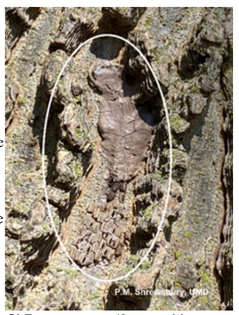
SLF egg masses (2, one with waxy covering, one without covering). You can see why SLF egg masses are so difficult to find.

SLF, like many invasive pests, is an unfortunate, challenging, and expensive situation. We will be interacting with MDA and many of you to keep everyone informed on SLF.