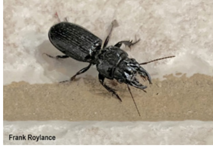
Adult big-headed ground beetle, Scarites subterraneus (Carabidae), is a voracious predator as an