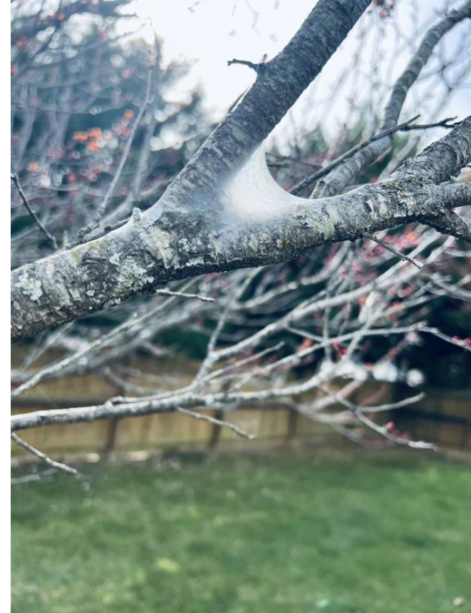
Early activity of eastern tent caterpillars.

Early activity of eastern tent caterpillars.