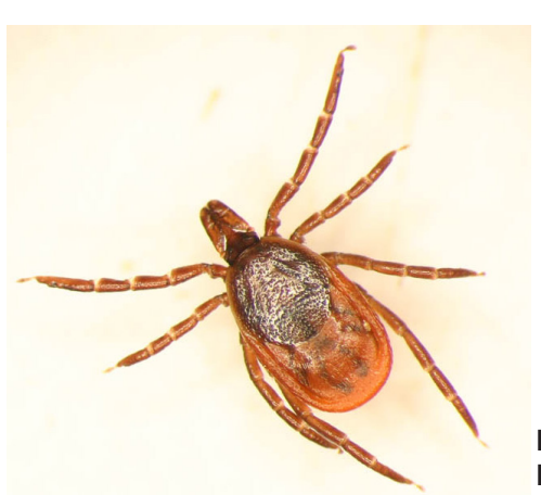
Deer tick adult

Lee Armillei, of Athyrium Design, reported deer tick immatures on multiple people in Fort Washington, PA last week. Be sure to inspect yourself for ticks after spending time outdoors. Research indicates that if you remove the tick within 24 hours you can reduce the likelihood of lyme disease.