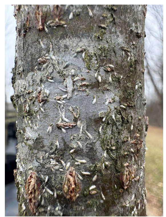
Japanese maple scale overwinters in the immature stage.