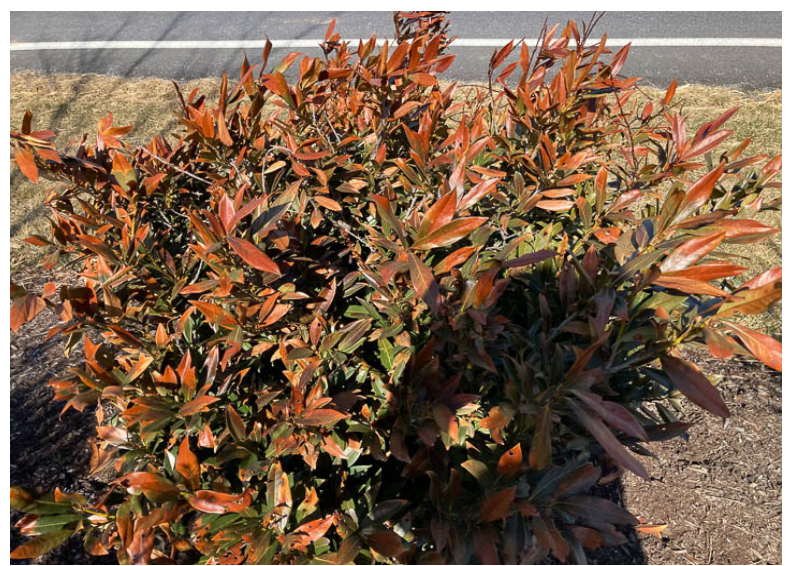
Winter damage on laurels.