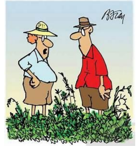
WE USED TO TIPTOE THROUGH THE TULIPS ... NOW WE JUST WADDLE THROUGH THE WEEDS!"