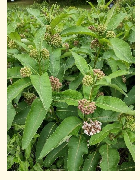
Common Milkweed colony that is already attracting bees and at least one monarch