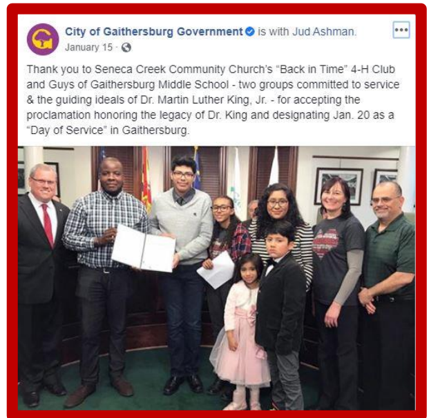
City of Gaithersburg's MLK Jr. Day of Service Proclamation