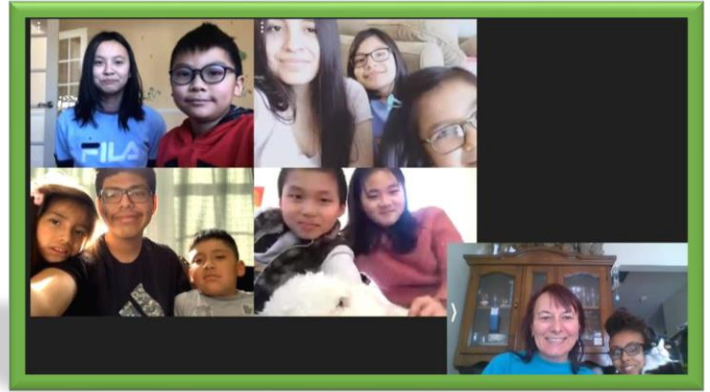
Members embracing technology for virtual meeting.

On April 15, lets wear Purple to celebrate our military kids. This now worldwide initiative was created by New Hampshire 4-H Military Club. Military kids are strong but are exposed to loneliness and hardships while their loved ones are saving lives around the world.