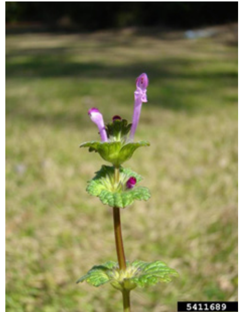
Henbit leaves and flowers.

Since henbit seeds germinate in the fall, take note of the areas that have henbit this spring, then go back to those same areas this fall and do herbicide applications and/or mowing to control seedlings and younger plants as needed.