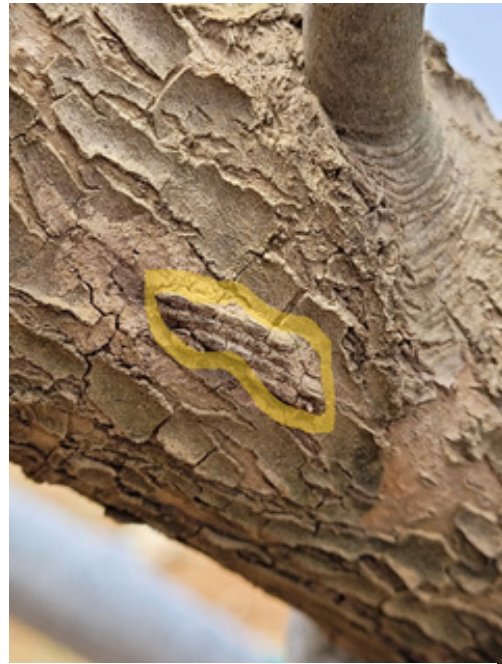
SLF egg mass on black gum in Harford Co.