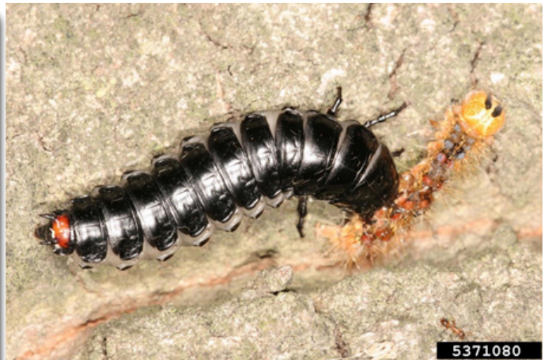
The larva of a fiery searcher feeding on a gypsy moth caterpillar.