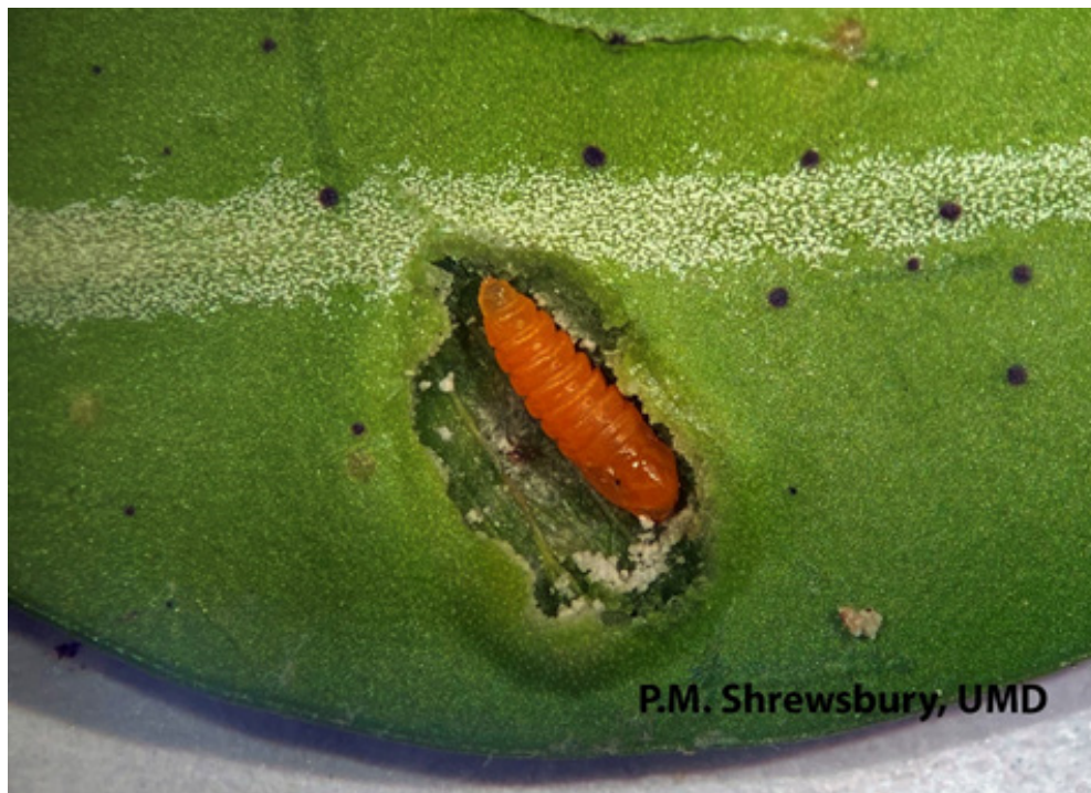
Fig. 2. Close up image of the early pupal stage of the boxwood leafminer. You can see the start of the wing and leg structures on one end of the pupa. Pupae will continue to develop until about 249 DD accumulations.

This is not the time to apply control measures since the damage is done. You want to protect the new growth of the boxwoods. Emergence of adult leafminers are a target stage, along with the larval stages, for treatment. See the April 9, 2021 IPM Newsletter write up on boxwood leafminer for more information on control options.