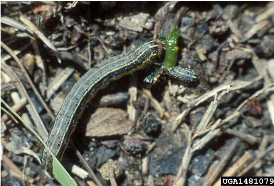
Fall armyworm caterpillar.

I am getting emails and text messages of turf managers finding larvae in turf. The reports are coming from the southern part of Pennsylvania and Prince George's and Baltimore counties in Maryland. There are dozens and dozens of larvae being found in turf right now. The pictures appear to be either cut worms or fall armyworms. We have requested samples from several people in order to identify the larvae. If you are seeing larvae, please send me photos. I need to see the head capsule, a side view, and a top view. Please let me know where you found them and the population numbers, so we can determine if these infestations are widespread. Below are photos of what armyworms look like. I need to determine if this is the same thing we are seeing now.