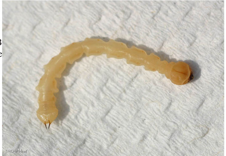
Emerald ash borer larva.