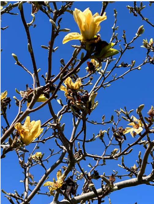
This magnolia, 'Madam Butterfly' bloomed, froze, and then bloomed again.