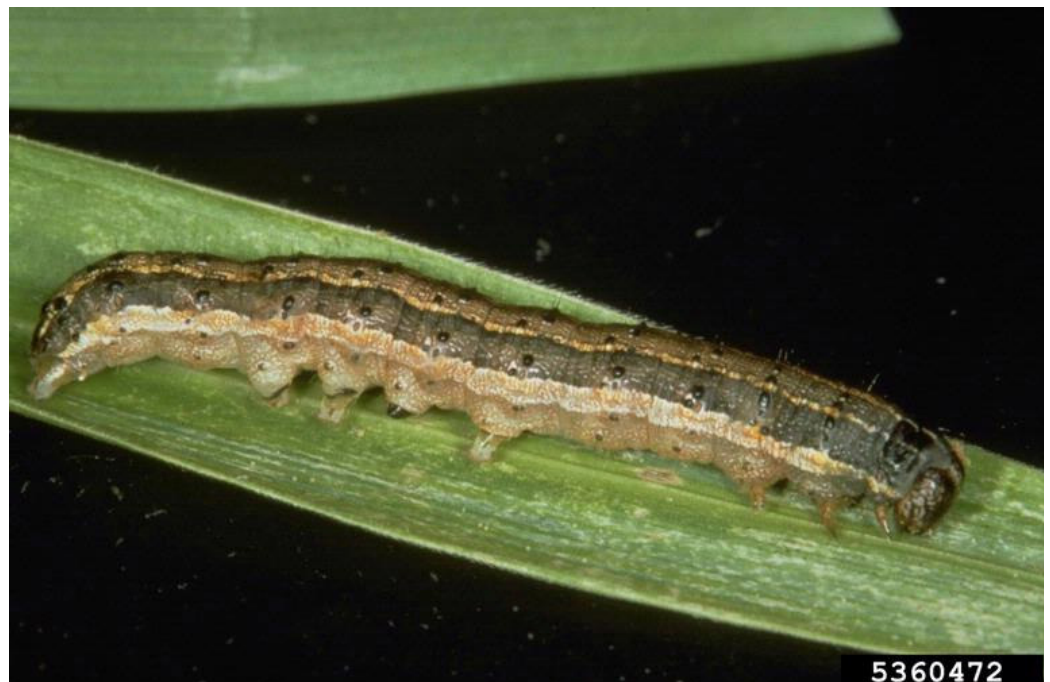
There is color variability with fall armyworm caterpillars.