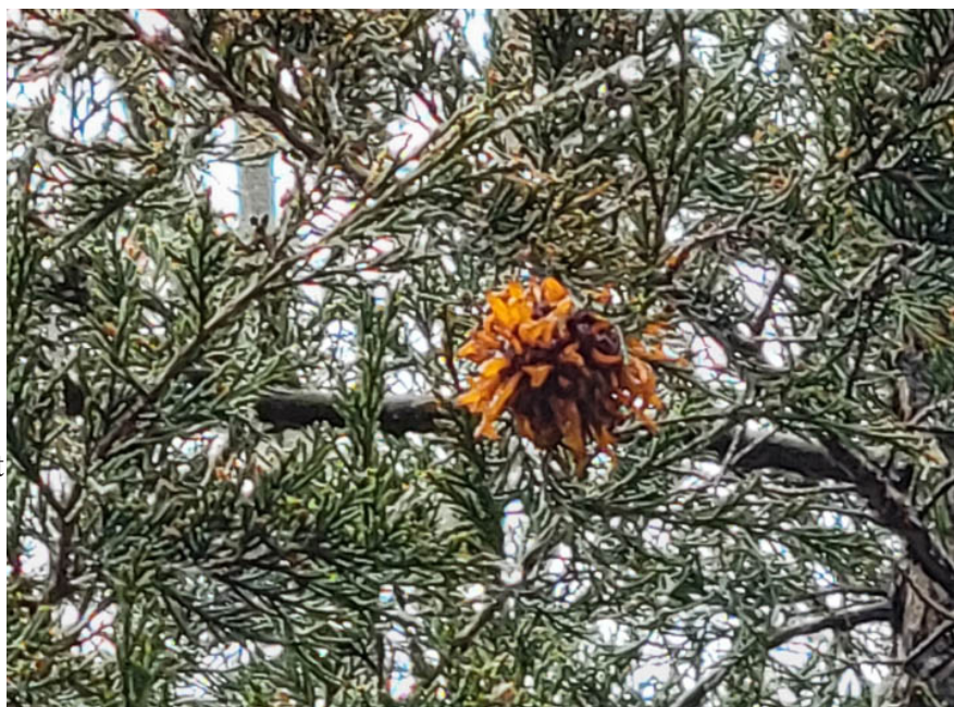
Gymnosporangium rust galls on juniper are starting to swell and become gelatinous.

Timing is similar for the various gymnosporangium rusts, so now is the time to treat the alternate rosaceous hosts. There is a Penn State fact sheet with more information on these rusts and the plant hosts for each rust-host complex. and suggestions for resistant plants available at https://apples.extension.org/table-of-juniper-hawthorn-and-crab-apple-resistant-to-rust-diseases/ .