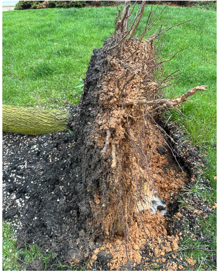
A shallow rooted tree came down during the recent heavy rains.