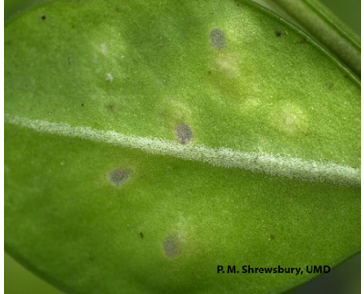
Fig. 1. Clear somewhat circular “window panes” can be seen on the underside of boxwood foliage as boxwood leafminer development approaches pupation.

In Bowie, MD on April 2 nd , we observed heavy boxwood leafminer damage and activity. Upon observation, there were “window panes” on the underside of the infested leaves (Fig. 1). These are made by late instar larvae as they are preparing to pupate (prepupation). The chew away most of the leaf material leaving just the membrane of the leaf so it is easy for the pupa, when ready, to push its way out of the leaf. When we dissected the leaf, the early pupal stage of the leafminer was present. The larvae are likely just pupating now. The wing and leg structures can be seen on one end of the pre-pupa. With time, the pupae will develop and push their way out of the leaf and eventually you will see pupal cases sticking out of the leaves. Based on our Pest Predictive Calendar , boxwood leafminer adult emergence occurs when the growing degree days around 249 DD and serviceberry “Autumn Brilliance” is in full bloom. Note – See the end of this newsletter to see what DD accumulations are in your area.