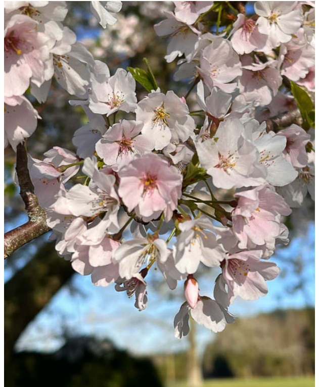
The light pink Yoshino cherry buds open to fragrant white flowers tinged with pink.