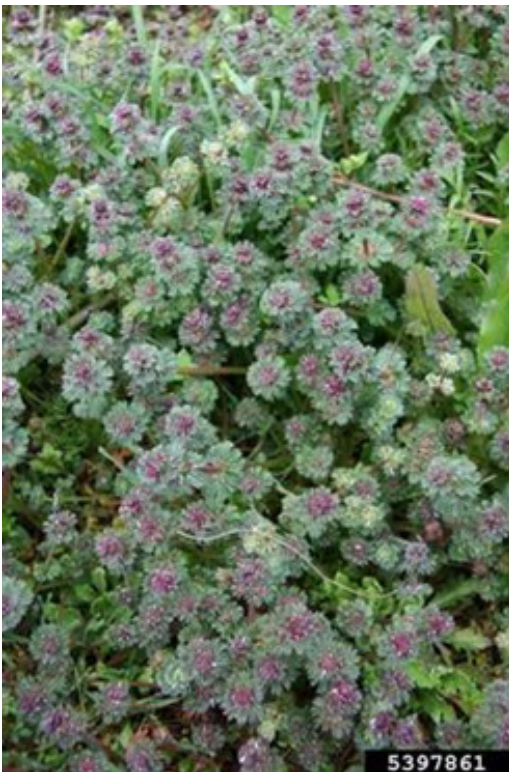
A henbit population.