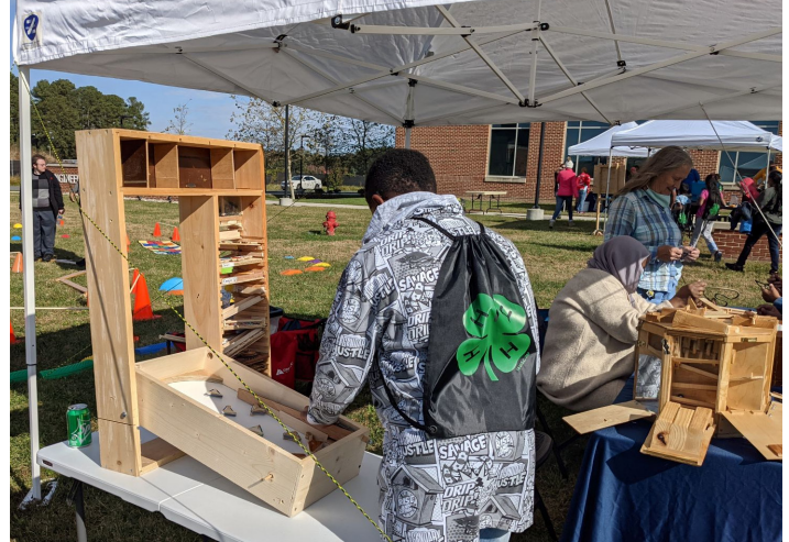
UMES 4-H hosted a STEM Festival where youth experienced free hands-on science activities.