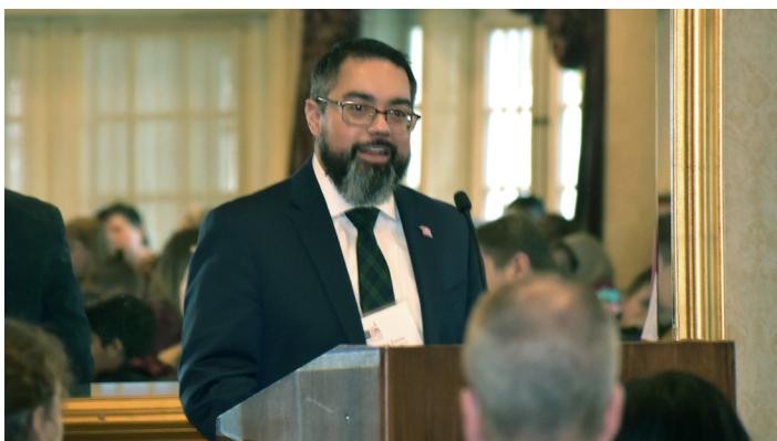
Maryland 4-H formalized a longstanding partnership with the Maryland Farm Bureau. Together, we prepare youth for future careers in agriculture & STEM.