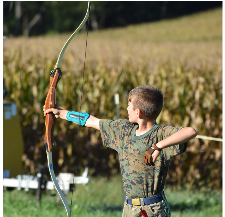
The shooting sports program is offered to youth 8-18 and fosters teamwork, precision, safety, and responsibility.