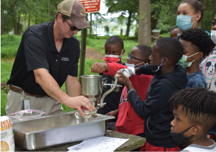
Outdoor activities with hands-on experiences allow youth to experience farming techniques.