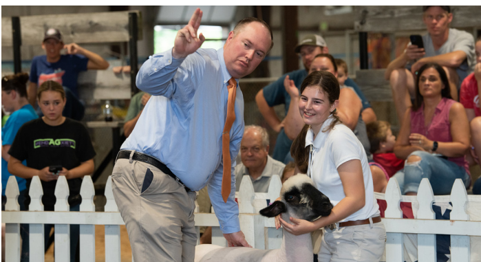
Local and state fairs allow youth to demonstrate their mastery of skills, build self confidence through competition, engage with local community and build life long friendships.

“I went completely out of my comfort zone and had the most amazing experience at 4-H camp so glad we had camp this year.” – 4-H Teen Camp Counselor