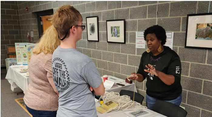
At the Mid Shore STEM Festival, youth from the surrounding area discover their interests in STEM-related programs, African American contributions to Agri Science and future careers.