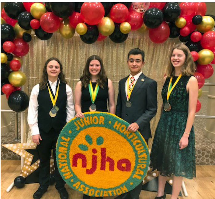
The Maryland 4-H Horticulture team placed second at the National Junior Horticulture Associations contest.

Six pollinator lessons were piloted in summer camps across the state. A Nurture Natives program was established to reach over 150 individuals through our educational programs hosted at local schools, camp, and fair. This program works with local farmers and nurseries to educate youth on the importance of biodiversity and increase the number of native trees and pollinators across the state.