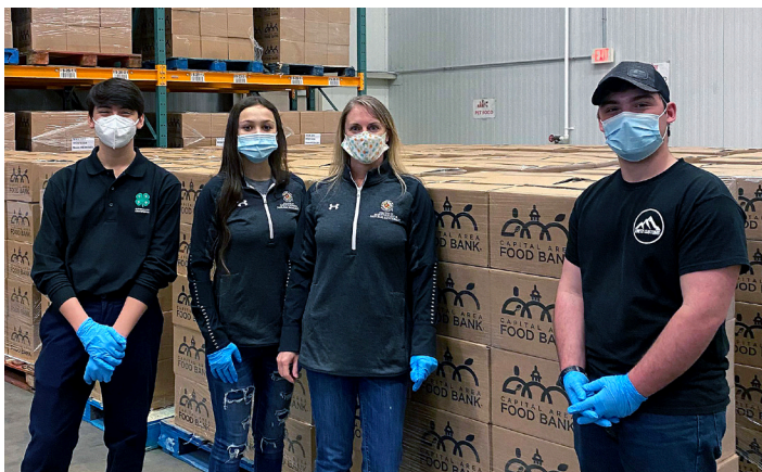
Maryland 4-H youth engage in service to community year long. Youth learn about responsibility to their community, country and world.