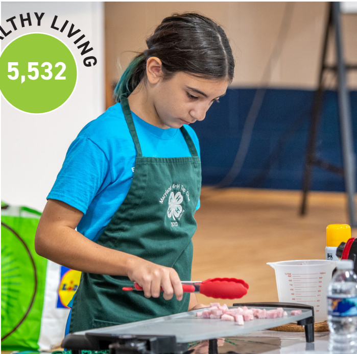
Youth demonstrate their cooking, nutrition and good safety skills in front of a live audience.