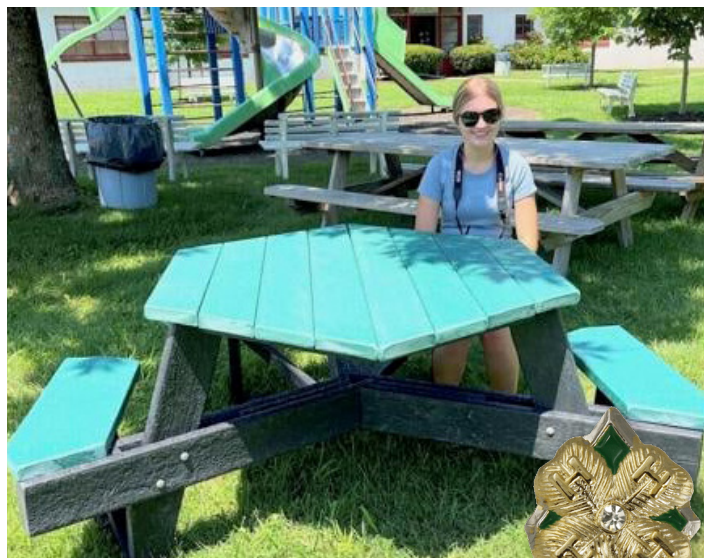
The Diamond Clover Award Program engages 4-H youth in a variety of projects and activities that will enable them to acquire skills related to leadership, community service, civic engagement and advocacy. The award consists of six levels that require a 4-H member to plan and accomplish a broad range of age-appropriate goals with supportive volunteers and community members. The Diamond Clover Project is one-way 4-H youth can make a lasting difference in their community.