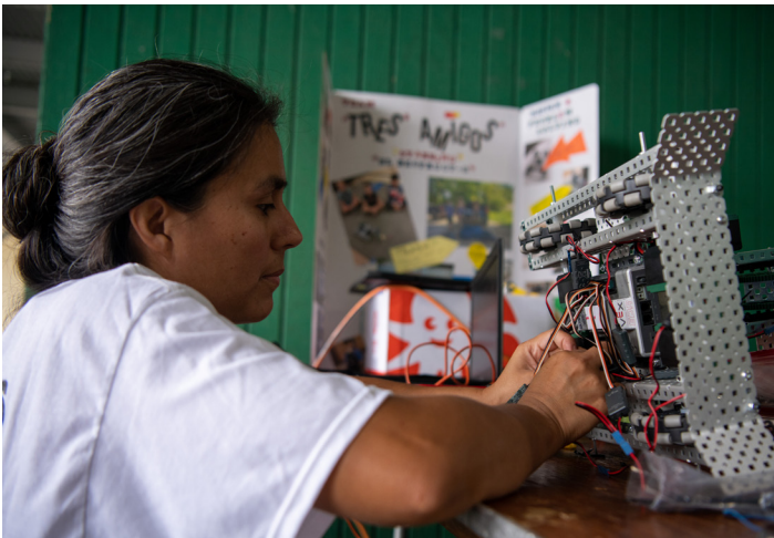
Volunteers spend countless hours with youth in our robotics programs, offering guidance, support, and practical experience.