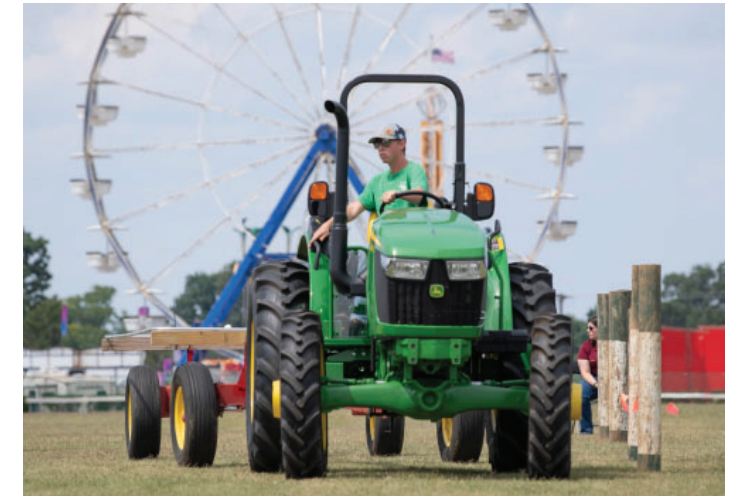
Operating heavy machinery is an integral part of the farming industry. Youth in 4-H learn about tractor safety and how to operate it more safely and efficiently.