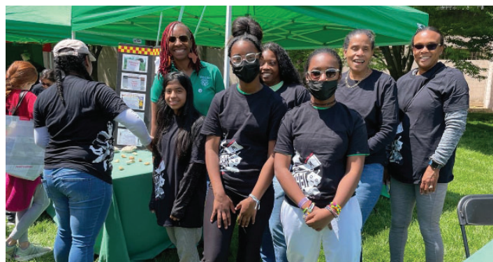
Maryland Day provides 4-H youth with an opportunity to lead hands-on activities and share their 4-H projects. Youth from the Seeds and Harvest 4-H club represented 4-H well at UMCP.