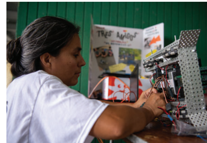
Volunteers spend countless hours with youth in our robotics programs, offering guidance, support, and practical experience.