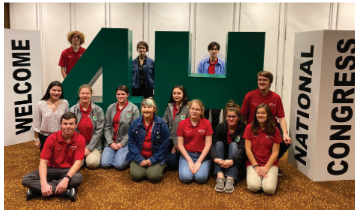
National 4-H Congress provides an opportunity for youth to develop leadership skills and meet other teens from around the world. Maryland 4-H teens apply for national leadership trips through their senior portfolio, essay, resume, and interview. Once selected, they participate in workshops, events, and community activities.