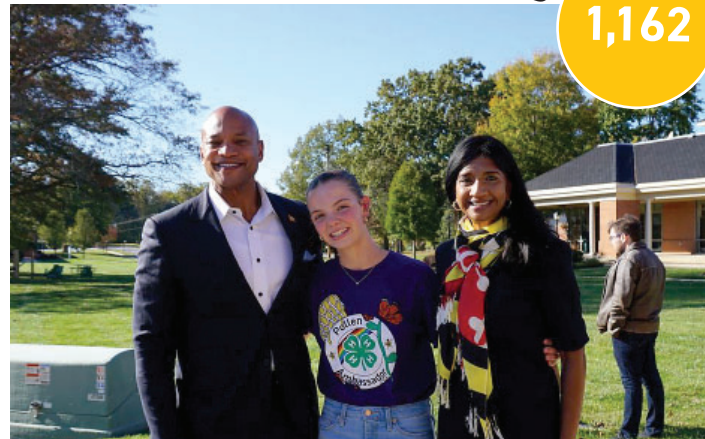
Teen Pollinator Ambassadors created a program to educate the public about native plants. In addition, they met with local legislators and shared their work.