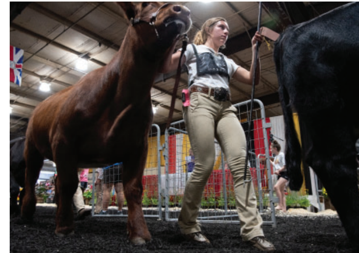
Fairs provide opportunities for 4-H youth to exhibit their project accomplishments, demonstrate mastery, develop leadership and teamwork, and receive important recognition.