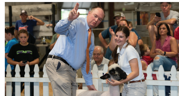
Local and state fairs allow youth to demonstrate their mastery of skills, build self confidence through competition, engage with local community and build life long friendships.

“I went completely out of my comfort zone and had the most amazing experience at 4-H camp so glad we had camp this year.” – 4-H Teen Camp Counselor