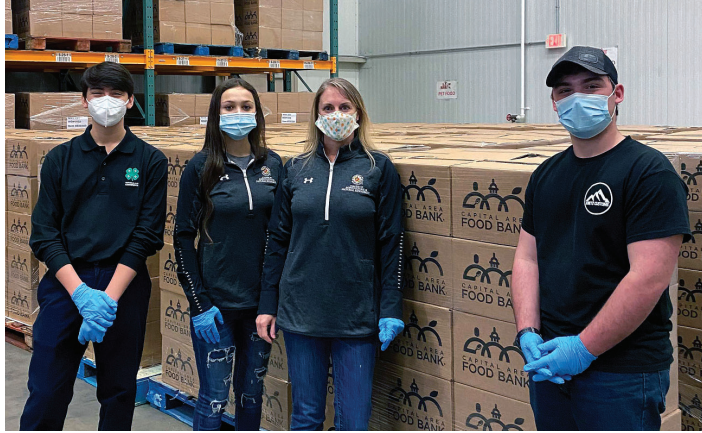
Maryland 4-H youth engage in service to community year long. Youth learn about responsibility to their community, country and world.