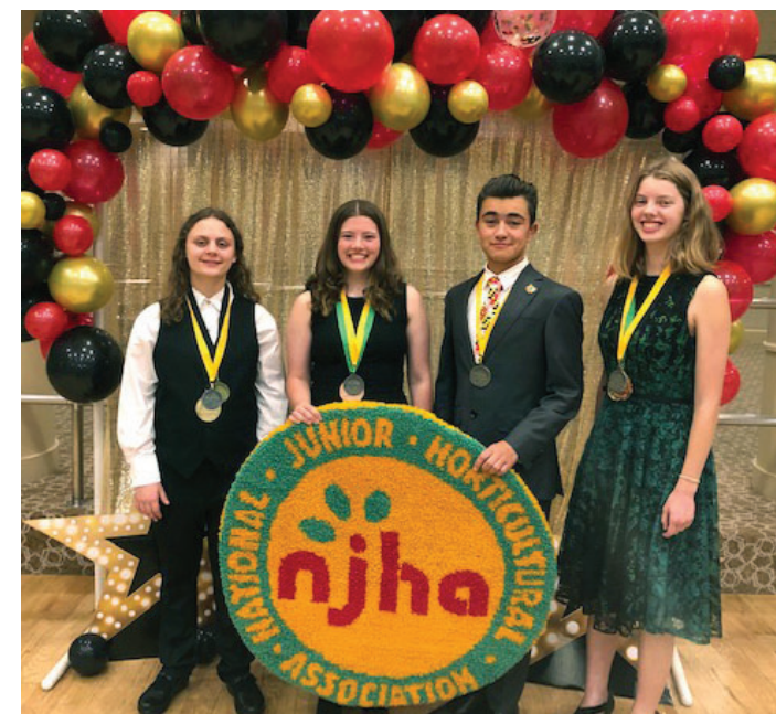
The Maryland 4-H Horticulture team placed second at the National Junior Horticulture Associations contest.

Six pollinator lessons were piloted in summer camps across the state. A Nurture Natives program was established to reach over 150 individuals through our educational programs hosted at local schools, camp, and fair. This program works with local farmers and nurseries to educate youth on the importance of biodiversity and increase the number of native trees and pollinators across the state.