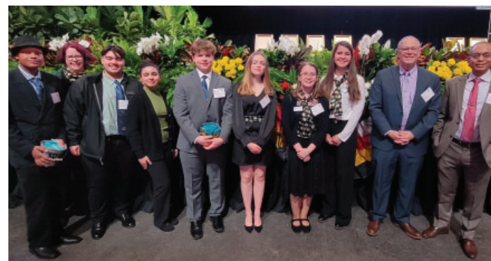
Maryland State 4-H Council members are invited to many events, including the Taste of Maryland Agriculture, where they help bring the flags of the counties and Baltimore City and meet and greet distinguished guests.