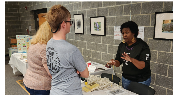
At the Mid Shore STEM Festival, youth from the surrounding area discover their interests in STEM-related programs, African American contributions to Agri Science and future careers.