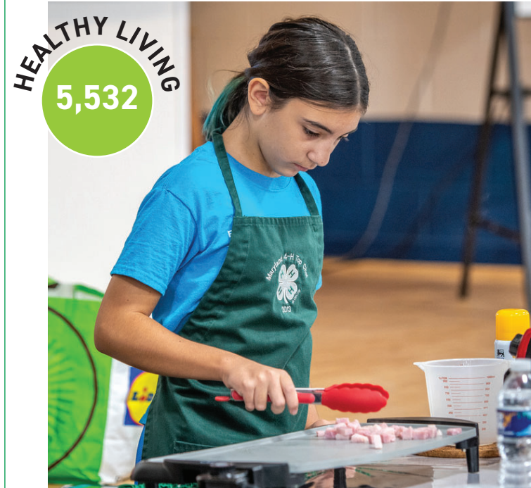
Youth demonstrate their cooking, nutrition and good safety skills in front of a live audience.