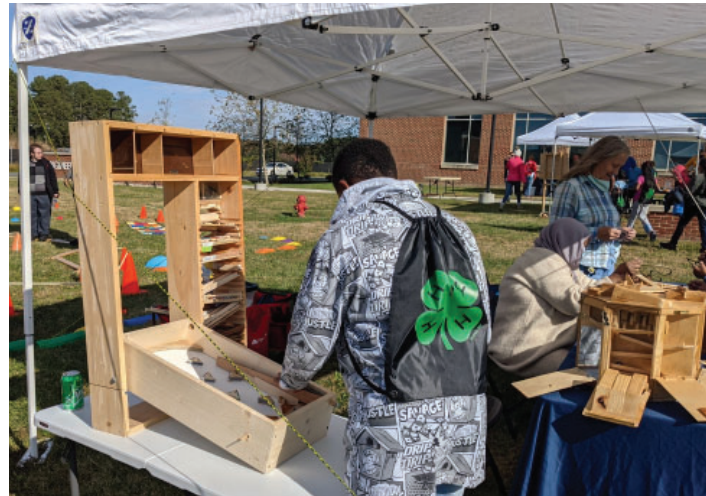
UMES 4-H hosted a STEM Festival where youth experienced free hands-on science activities.