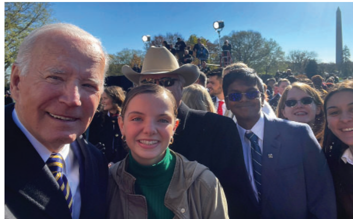
Youth from our Maryland 4-H State Council were invited to the Turkey Pardoning by the President of the United States and shared their 4-H story with elected officials at the White House.