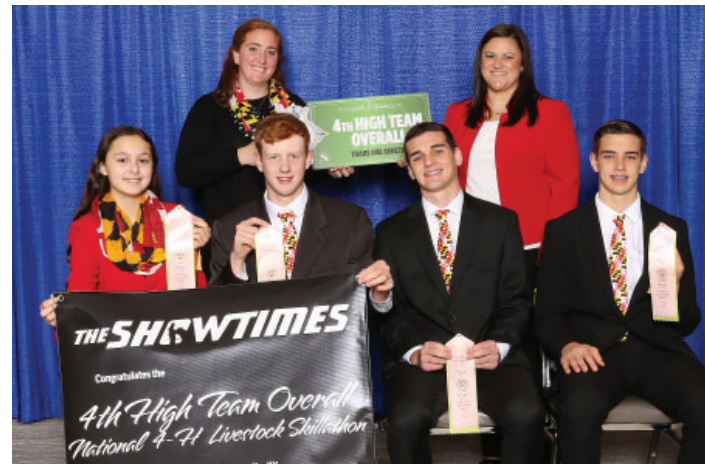
Maryland 4-H youth demonstrate their knowledge and skills at several national 4-H animal science competitive events. Youth prepare year long through hands-on workshops, coaching sessions and local competitions. This year, our Livestock Skillathon team placed 4 th in the country .