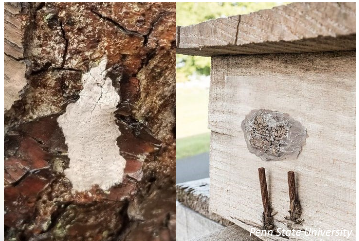
Figure 3. Spotted lanternfly egg masses on tree trunk (left) and wood pallet (right).