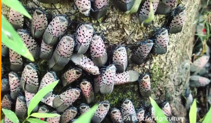
Figure 1. Spotted lanternfly adults on tree trunk.

We are getting several inquiries regarding the invasive spotted lanternfly (SLF). Adults are now active and people are noticing them all over Harford County. If you see this insect, attempt to kill it, then you can report it to the Maryland Department of Agriculture by calling (410) 841-5920, or complete the online form .