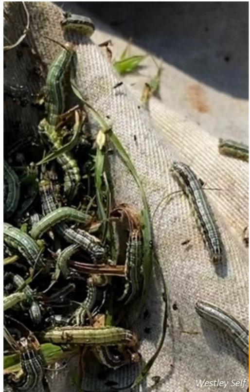
Figure 1. Fall armyworms in grass hay.

Recommendations from southern states that deal with armyworm more regularly are to sample 1 sq. ft, if there are more than 3 armyworms ½ inch long, a treatment is warranted, but if worms are 1 ½" long, they are close to pupating. We have many options for armyworm control in pastures including Pyrethroids, IGRs (ex Intrepid), Diamides (Vantacor and premixes like Besiege), spinosyns (ex Blackhawk) and Lannate. Growth regulators are slow acting, thus are only going to be effective on small worms. Before treating armyworm, remember to read labels carefully; the label is the law.