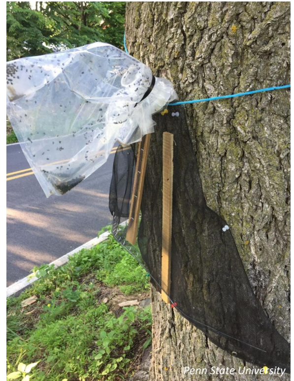
Figure 2. Spotted lanternfly circle trap.

This insect is likely here to stay, so if you have a vineyard or an orchard, you'll need to be prepared to scout and treat for SLF next year to manage this pest. Since Pennsylvania has been dealing with SLF since 2014, there are several great resources on Penn State's website: https://extension.psu.edu/spotted-lanternfly-management-resources .