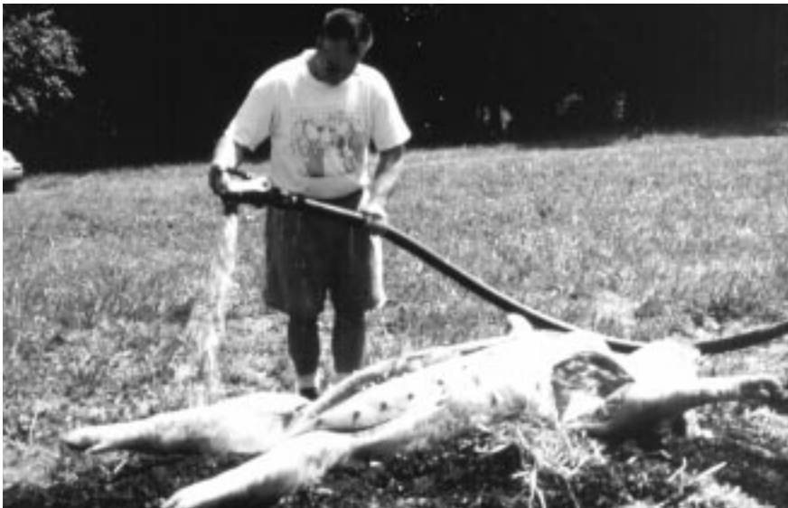
Figure 6. Preparing a large carcass for compost.

Composting carcasses is a good biosecurity measure because most pathogenic organisms common to animal production can be killed by exposure to thermophilic temperatures (135 to 155 °F) in a compost pile or bin. However, some pathogenic organisms such as BSE (mad cow disease) and scrapies in sheep may not be controlled at compost process temperature. Farmers with known cases of these temperature-resistant disease organisms should seek the advice of their veterinarian.