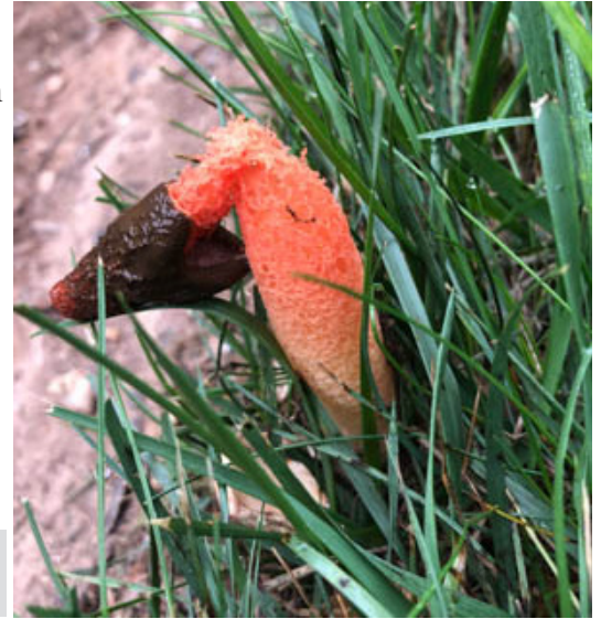
The smelly slime on the tips of stinkhorn fungi attracts flies

Spencer Ecker, Potomac Flower & Garden Design, found stinkhorn fungus in Great Falls, VA this week. These fungi show up suddenly in lawns and landscapes. Spores adhere to the tip in a smelly slime which attracts flies. They break down old plant material.