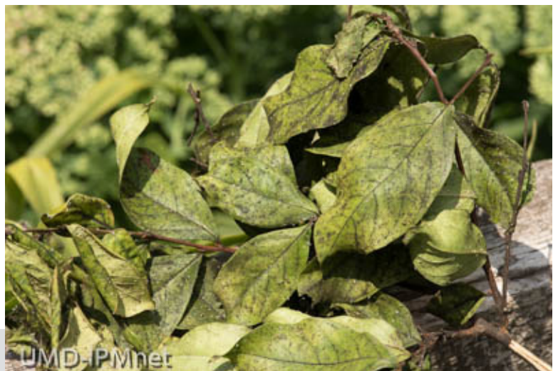
A heavy infestation of crape myrtle aphids is producing honeydew on which sooty mold grows

Crape myrtles are looking beautiful at this time of year with their flower displays. Check the foliage for crape myrtle aphids, which are extremely active in August. Mark Schlossberg, ProLawn Plus, Inc., found aphids on foliage and heavy sooty mold growing on the honeydew coated leaves. Endeavor and Altus both work well in controlling these aphids.