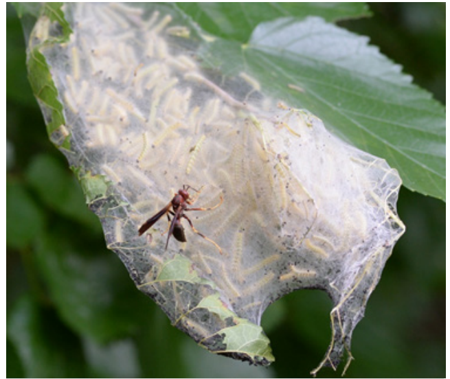
A Polistes wasp pulling at the webbing of a fall webworm nest to get a caterpillar.