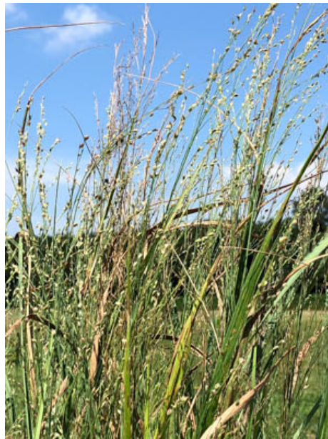
Panicum virgatum 'Northwind' produces seed that persists into winter for a long season of interest