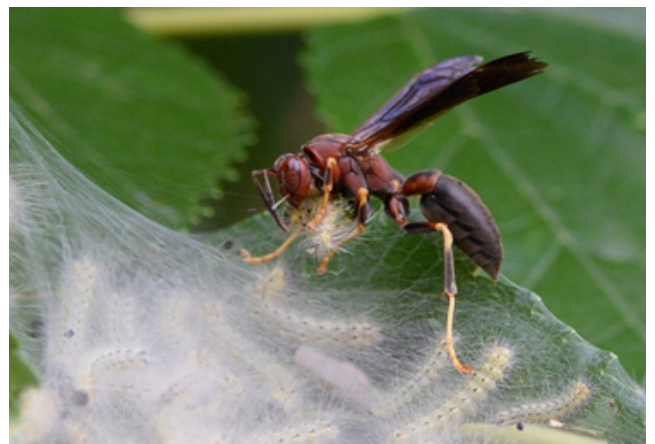
This Polistes wasp is macerating its prey, a fall webworm caterpillar that pulled out of its webbed nest. The wasp will bring the macerated prey back to its nest to feed to wasp larvae.