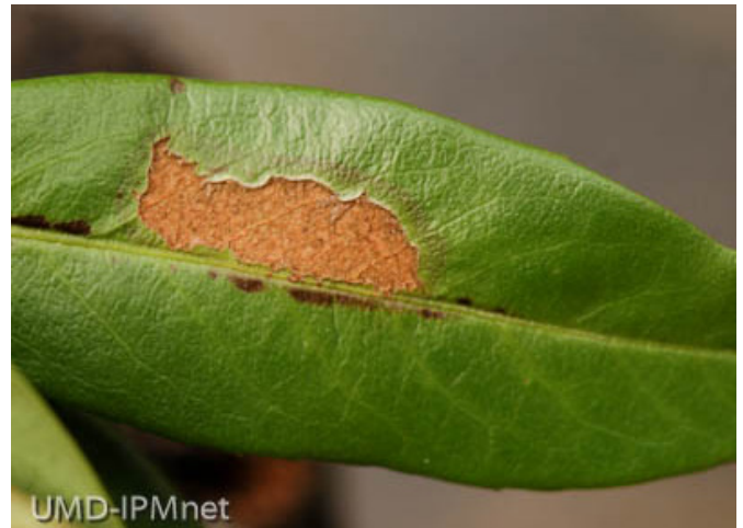
Look for snowy tree cricket damage on plants such as cherry laurel