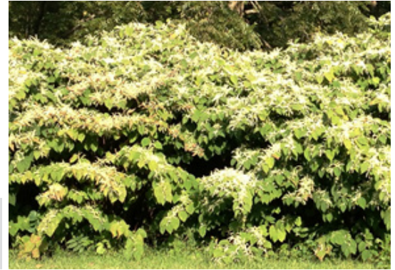
Japanese knotweed is often transferred to new sites in fill material