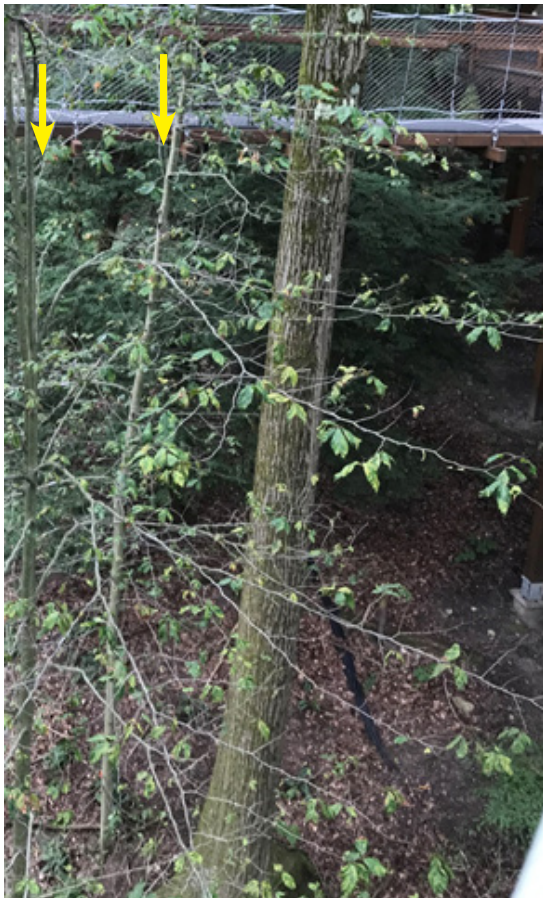
Figure 2. Loss of foliage (note bare branches) due to Beech Leaf Disease on two young beech trees. Arrows point to trunks of affected trees.

For several years, the cause of this disease was unknown, but Japanese researchers recently described a new nematode, Litylenchus crenatae , found in symptomatic foliage of F. crenata , the Japanese beech, in Japan. The nematode has also been recently confirmed in symptomatic leaf tissue in the US, but there is much more to learn about how the nematode is spread and how it causes disease. We have not yet found this disease in Maryland , but this year's discovery of affected trees on the East Coast has raised our awareness and our concern. If you see these symptoms on beech trees in the landscape or in forested areas, please contact me via email ( rane@umd.edu ) and attach photos of the symptomatic leaves.