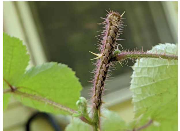
Katydid eggs are often appressed to woody plant stems

Erin Kimberly found katydid eggs on wineberry last week. Females lay eggs in late summer. The eggs are oval-shaped, somewhat flattened, and laid in rows on small plant stems or sometimes in the soil. Eggs hatch in the fall. Paula Shrewsbury covered them as the Beneficial of the Week in the October 7, 2016 IPM Report .