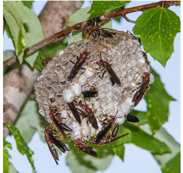
A paper wasp nest attached to a tree branch, being tended by adult wasps, Polistes annularis

workers and take over the care of the nest and young. Workers do not reproduce. The foundress (queen) is then mainly responsible for reproduction. Not all potential foundresses are successful at starting a new nest. These individuals may join another successful foundress and assist her in brood care. These subordinates may try to lay eggs in the foundress nest, but the dominate foundress finds and eats her subordinate's eggs. She truly is the dominant individual. The colony will grow throughout the summer with more than a hundred workers being produced. As fall approaches the colony changes its production from making workers to making future foundresses and males for their mates. The colony ultimately declines because workers are no longer produced, and the future foundresses leave the nest to mate and find a protected location to overwinter. In the spring the cycle starts over again.