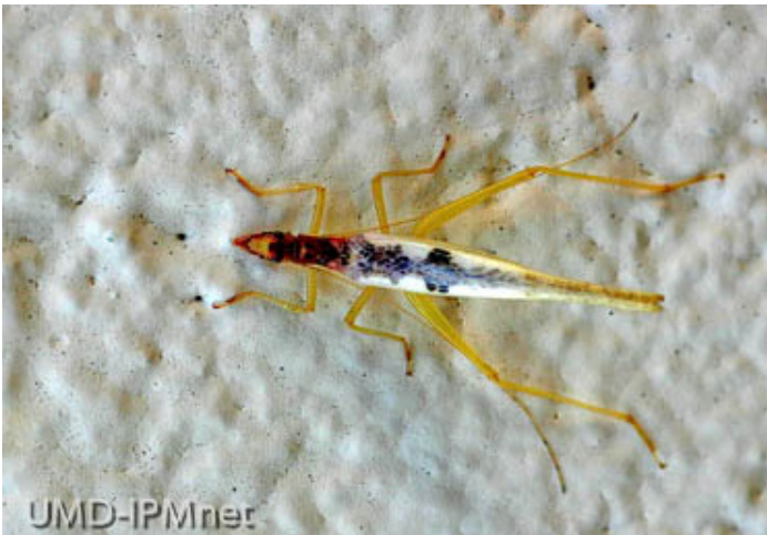
A close-up of a snowy tree cricket on our building

Snowy tree crickets are very common in Maryland, and we will see the adults feeding on the upper surface of cherry laurel and rhododendrons over the next couple of weeks. The damage really becomes evident in September, but the game is over at that point.