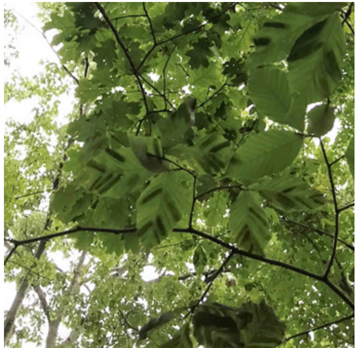
Figure 1. Dark green stripes on American beech leaves in Ohio affected by Beech Leaf Disease.