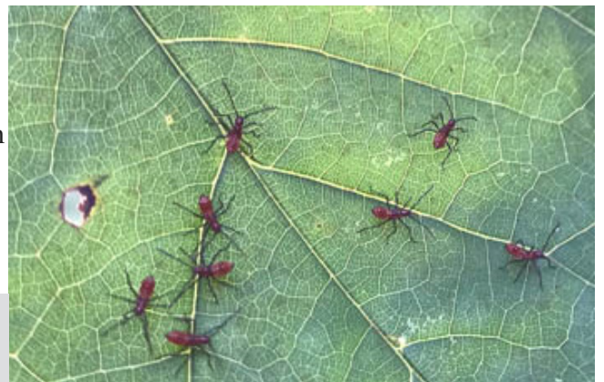
Assassin bugs continue to hatch out as we move through August

In July, we started receiving pictures of assassin bug egg masses on trunks of trees. This latest generation just started hatching in central Maryland this week. Nancy Woods, MCNPPC, sent in these pictures of young nymphs of assassin bugs that just hatched in the McCrillis Gardens in Bethesda. Assassin bugs are wonderful general predators and feed on foliage feeders, such as caterpillars and beetles.