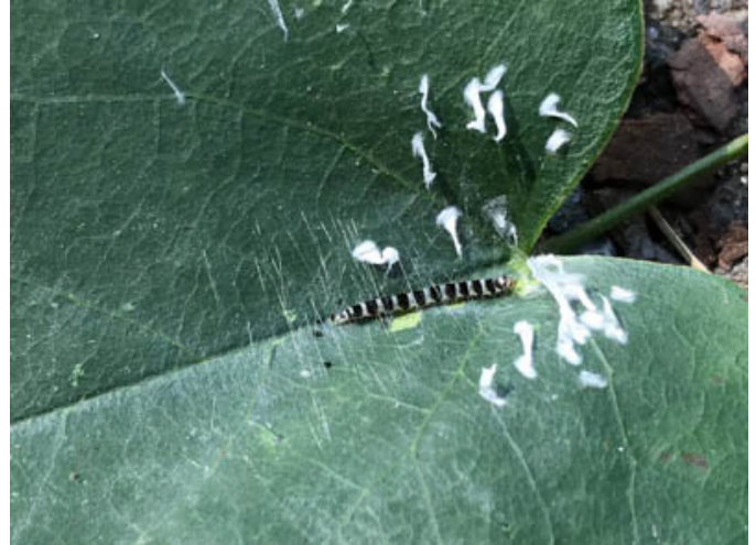
Close-ups of the redbud leafroller caterpillar showing damage and webbing