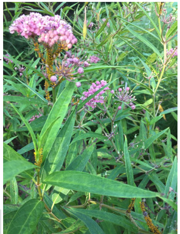
Oleander aphids can be found coating the stems of milkweeds

Connie Bowers, Garden Makeover Company, found a significant infestation of oleander aphids on Asclepias incarnata (swamp milkweed). Connie that she cut off some bad stems and tried to dislodge some with water, but the population seems to be increasing. They are generally not a problem. Predators feast on them and collapse populations.