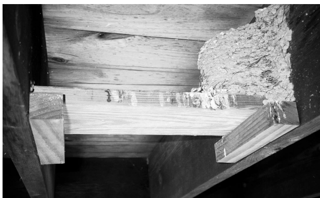
Figure 1. Barn Swallow nest.

to allow enough space between the shelf and the ceiling to allow a nest to be built up several inches. As seen in Figure 1, a board attached to the joists is an easy way to provide nesting opportunities for Barn Swallows and is also located in an area where bird droppings are not a concern.